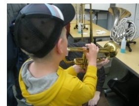
Kids gained hands-on experience with real musical instruments during a special program at the Mystic & Noank Library. The GEF helped with funding.