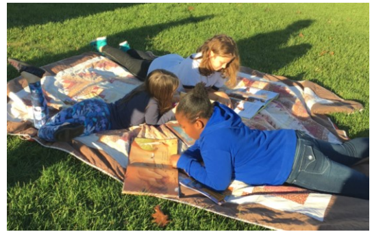
Local kids had better access to books during the summer thanks to a grant to Children First Groton from the Groton Education Foundation.

It's also easy to give online at www.grotonschools.org/GEF .