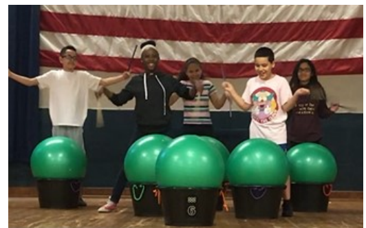
"Drums Alive" at West Side STEM Magnet Middle School encouraged creative expression and engaged students with a variety of learning styles.